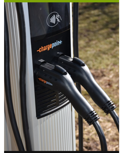
Charging stations such as this one at the Thompson Town Hall may soon spread around the County.