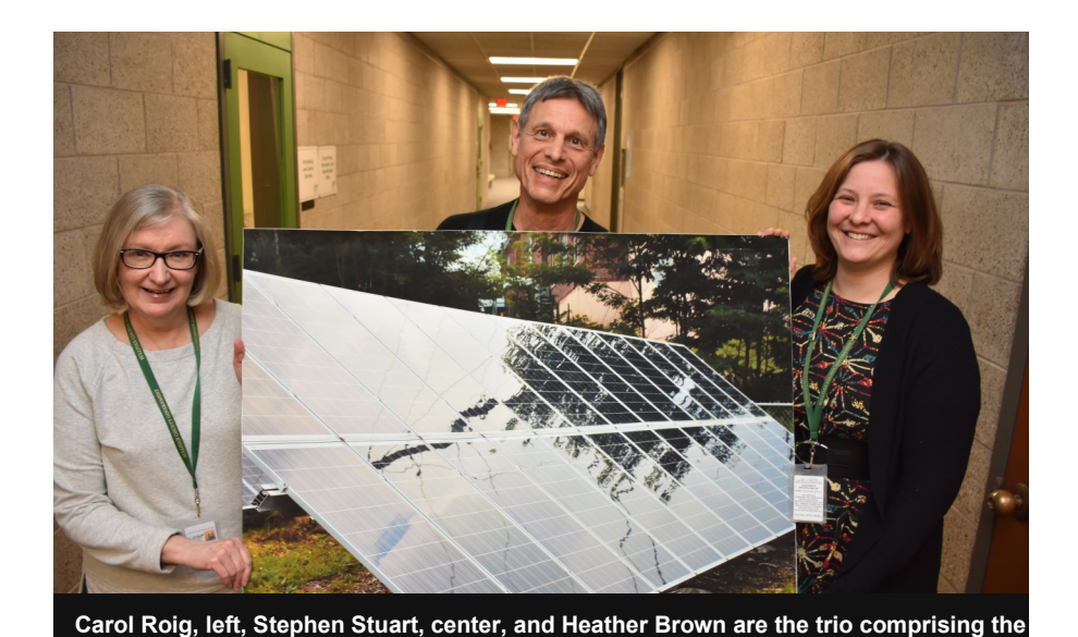
Departmental Spotlight: The Office of Sustainable Energy