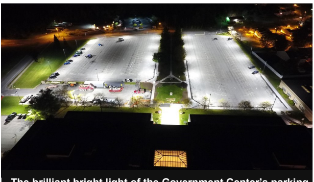
The brilliant bright light of the Government Center's parking lots emanates from ultra-efficient LED bulbs.

In 2005, the County commissioned a study of wind resources, followed by the adoption of a Green Vision Statement in 2007. OSE itself was established in 2008, but the realities of the Great Recession delayed its rollout, with the County instead relying on a contract with