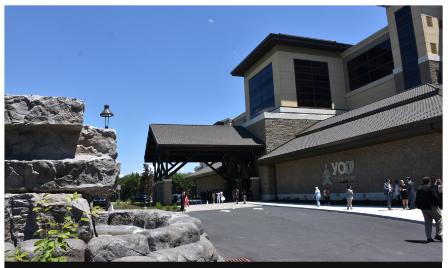
YO1 Luxury Nature Cure is a world-class health and wellness lodging center that just opened last month along the shore of scenic Bailey's Lake north of Monticello.