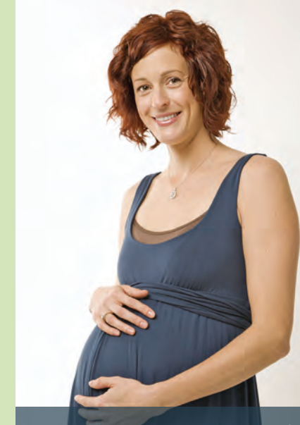
When you protect yourself from lead, you also protect

Although lead paint was banned from home use in 1978, the dust from lead paint is still the number one source of childhood lead poisoning.