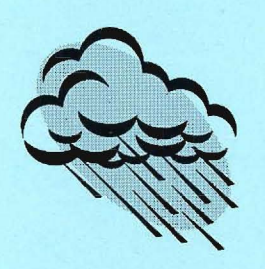
Second in a series of two brochures about the National Flood Insurance Program. The first is entitled Common Questions and Answers about Flood Insurance in New York State.

This brochure discusses basic standards governing construction in floodplains mapped under the Naitonal Flood Insurance Program in New York State.