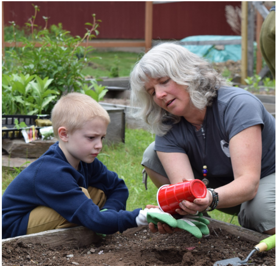
Planting a seed in one of our local schools' Catskill Edible Gardens also plants a seed in the impressionable minds of students. And like the fruits and vegetables that will sprout in these gardens, that seed of knowledge will bear fruit when one day these children are growing gardens of their own.