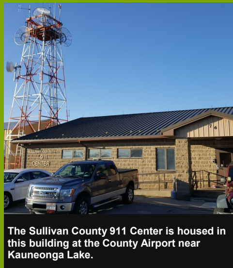
The Sullivan County 911 Center is housed in this building at the County Airport near Kauneonga Lake.